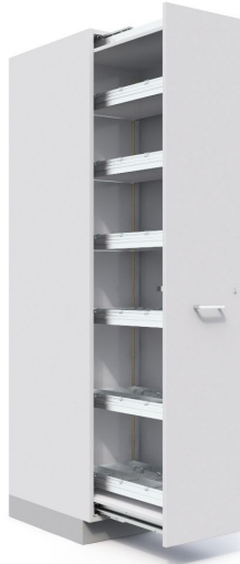
M-LC3 M-LC4 M-LC5